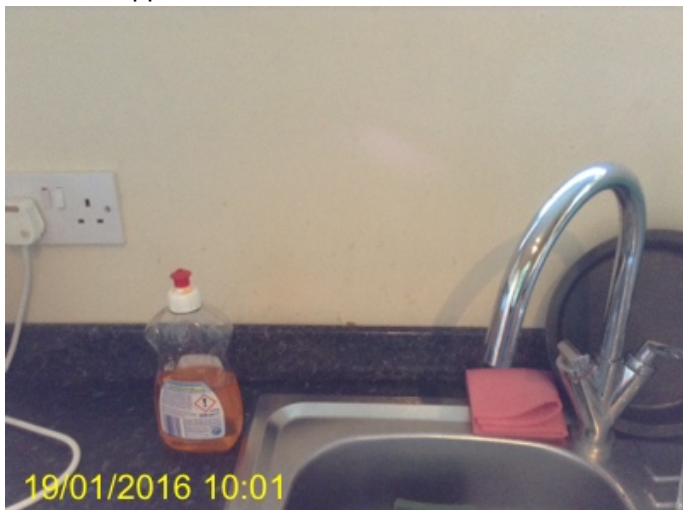
Kitchen-Overview-Walls & Ceilings, Flooring, Windows & Doors & Appliances