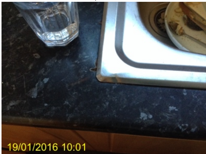
Kitchen-Overview-Worktops & Units