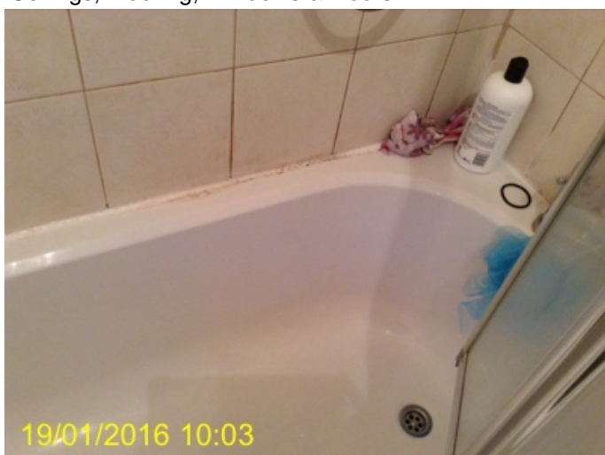
Bathroom-Overview-Grouting / Sealant, Walls & Ceilings, Flooring, Windows & Doors