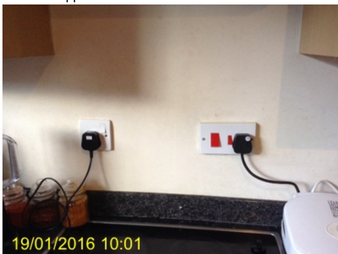
Kitchen-Overview-Walls & Ceilings, Flooring, Windows & Doors & Appliances